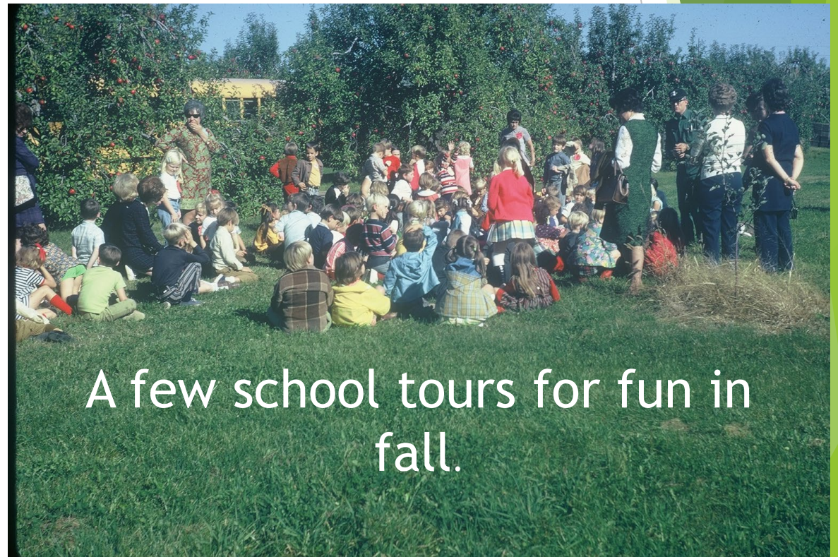
A few school tours for fun in fall.