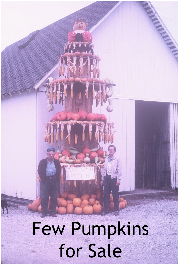
Few Pumpkins for Sale