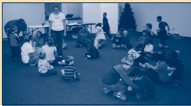
Mental Health Association

The following grants were funded through a portion of the earnings from an unrestricted endowment, the Ambassador Fund. Like all gifts to the Foundation, a gift to the Ambassador Fund is invested forever. When a donation is made to the Ambassador Fund, it will impact our ability to help this community this year, next year, and when the donor's grandchildren's grandchildren are submitting grant applications. The Ambassador Fund allows the Foundation to do more than just administer the endowment funds for specific purposes like a scholarship or to help a particular nonprofit. The Ambassador Fund makes it possible for current and future community causes to have the monetary support they need to make a difference here in Hancock County.