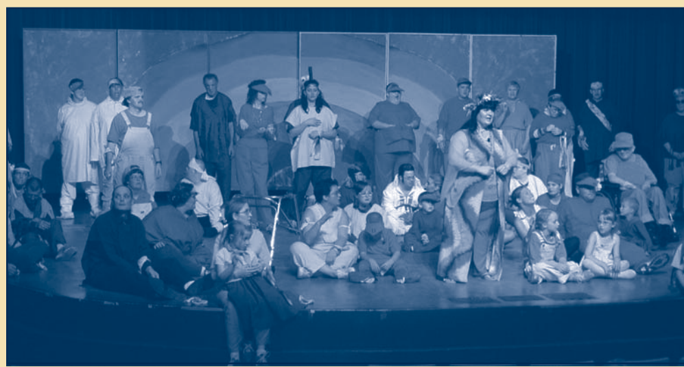
The cast of the Arc production, A Rainbow Dream, showed all their colors at the 2003 performance at Greenfield-Central High School.

established to provide income for equipment and/or programs that support the mission