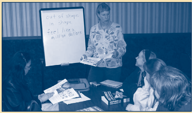
Greenfield Learning Center