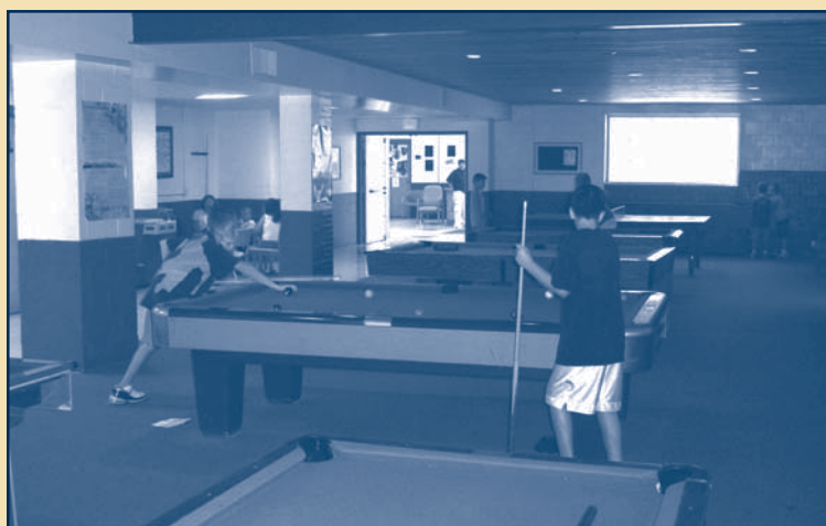
Hancock County Boys & Girls Club

HANCOCK COUNTY FRIENDS OF THE FAMILY ENDOWMENT FUND —established to provide funds for operations, capital expenses, and capital