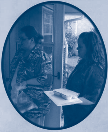
Meals on Wheels

NANCY TERRELL MILLER ENDOWMENT FUND —established to provide support to organizations, projects, or initiatives in Vernon Township and/or Hancock County dedicated to helping youth and individuals in need of special services or fire protection.