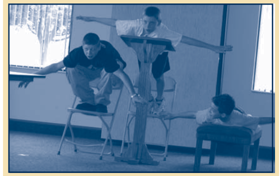
Arc of Hancock County

BROOKVILLE MARRIAGE ENDOWMENT FUND —established to benefit the married couples enrichment program at the Brookville Road Community Church.