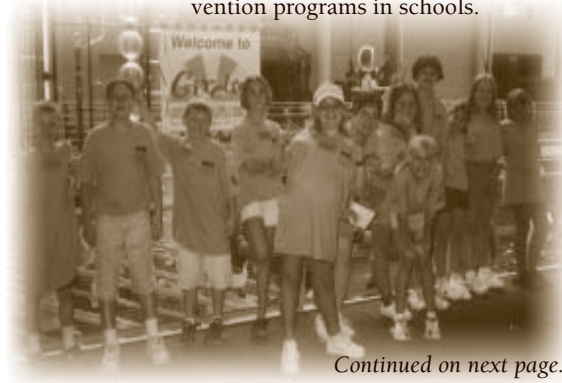
Continued on next page.

This grant assisted with the purchase of three used passenger vans that support the student transportation program. These vans bring members to